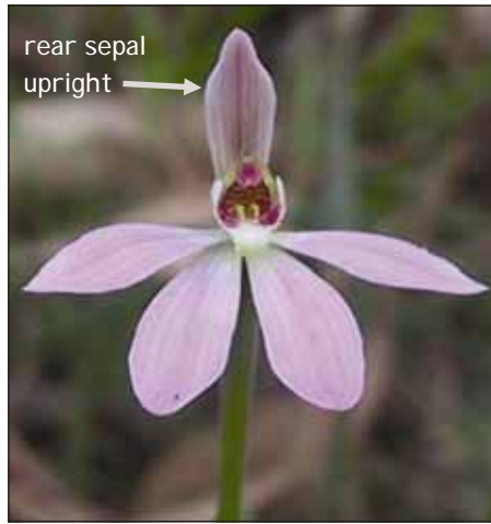
Caladenia carnea Pink Fingers

Mid-Spring. Occasionally pink but mostly white flowers on Barrm Birrm (above). Stem 15-25cm. Rear sepal is held upright, rarely bent (below right). Distinctive, red-striped labellum. Albino flowers are seen occasionally (below left). Common in most areas.